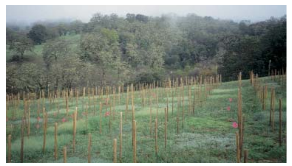
Experimental plots at Hopland were designed to test for the multiple functions that plant species provide to ecosystems.

Undesirable plant invasions. Nitrogen availability can also influence invasions by non-native plant species in rangeland. For example, two recent invaders, goatgrass and medusahead, can lower nitrogen availability in the soil (especially during winter), adversely affecting the productivity of desirable grassland species (table 3). These invasive species can displace resident species by directly competing