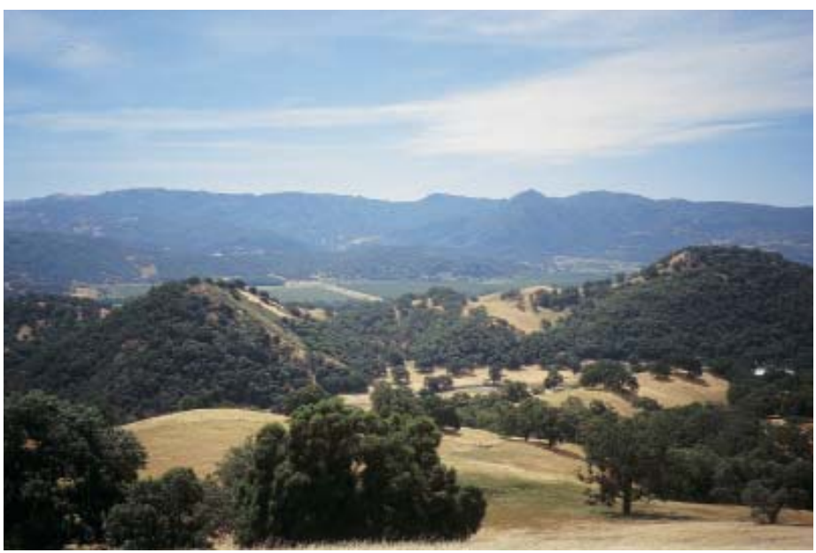
In natural systems, plants rarely exist as monocultures; a diverse plant community is more likely to contain species that flourish despite environmental fluctuations. Understanding the role of plant species in ecosystem functions can be critical for land uses such as rangelands (foreground) and agriculture (background).

Dahlgren R, Singer M, Huang X. 1997. Oak tree and grazing impacts on soil proper-