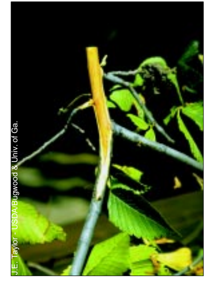
Sapwood stain caused by Dutch elm disease.

free from attack by insects and diseases? I pointed out that, on average, insect herbivores and plant pathogens were relatively rare on plants, generally causing low amounts of damage. Although the natural enemies of insect herbivores (but not pathogens) and the weather do play an important role in keeping these organisms rare, the inherently low quality of tree tissues as food may well be the most important factor. Trees have low and very variable nitrogen content, a critical nutrient for insects and pathogens, and they contain a diversity of physical and chemical defenses that collectively make the extraction