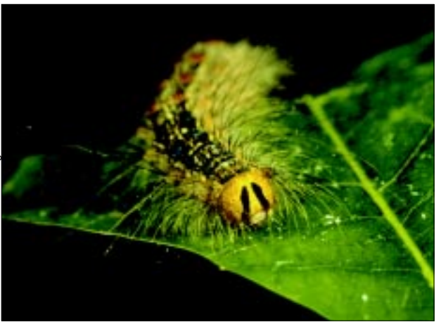
Year-to-year damage from gypsy moths is minor, but during outbreaks they may consume up to 100 percent of a tree's foliage.

major air pollution events. However, the occurrence of such events can be a warning signal and a stimulus for increased insect and disease monitoring.