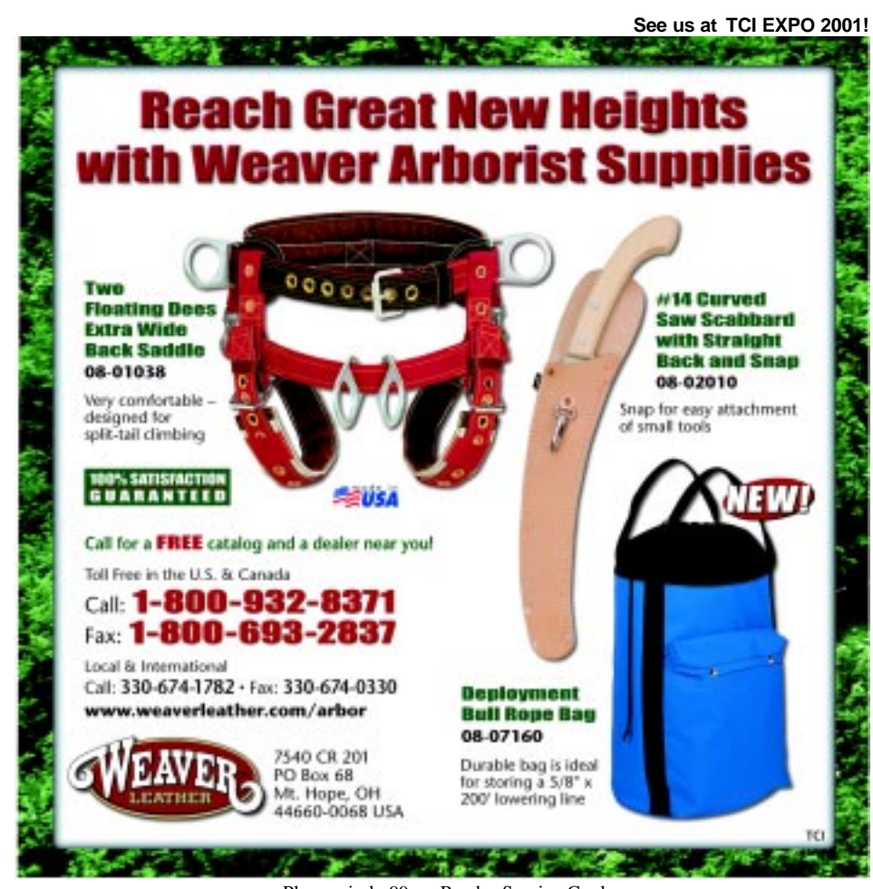
Please circle 99 on Reader Service Card

Second, for insect herbivores only, outbreaks can be caused by declines in