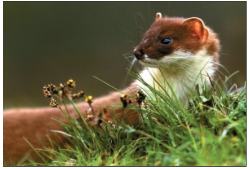
Figure 4. A stoat or short-tailed weasel (Mustela erminea), a specialist predator on rodents known to drive some populations through boom and bust cycles or chaotic fluctuations. This type of predator might not be protective of human health, despite having a strong effect on reservoir populations. This lack of a protective role would occur if disease outbreaks are related to rodent outbreaks, which in turn are facilitated by specialist predators.

The second complicating issue is that population dynamics (the pattern of change in numbers through time) and correlated changes in behavior and disease incidence are arguably more important to disease transmission to humans than is population density per se. Consequently, the simple fact that predators reduce average prey numbers is an inadequate basis from which to assert unequivocally that predators protect human health. Predators can exert different types of effects on prey population dynamics. Mustelid (weasel family) predators that specialize on particular rodent prey tend to cause dramatic fluctuations in numbers (Hanski et al. 1993; Figure 4).