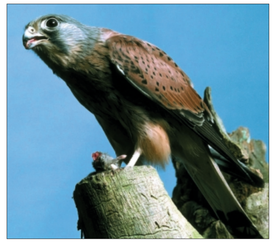
Figure 5. The kestrel (Falco tinnunculus), a generalist, mobile rodent predator, is thought to regulate rodent populations at more consistently low levels. This type of predator appears most likely to protect human health by chronically suppressing reservoir populations, keeping population density low.

This occurs largely because these predator populations are tightly coupled to those of their prey. As rodent populations grow, so too do weasel populations (albeit delayed, because the conversion of prey into the next generation of weasels takes months). Long delays in the impact of prey density on predator density are well known to cause strong fluctuations in prey populations, which in the case of rodents take the form of cycles (Hansson and Henttonen 1988) or chaos (Hanski et al. 1993).