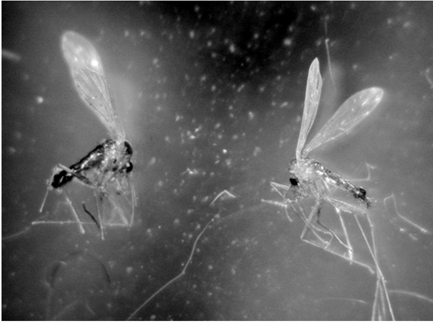
Fig. 1. Photomicrograph of female (left) and male (right) L. vexator collected at the IES in Millbrook, Dutchess County, New York.

Sand fly activity was highly seasonal in both years. In 2001, the first sand fly was captured on 12 July and the last on 6 August; corresponding dates for first and last appearance in 2002 were 23 July and 12 August (Fig. 2). Some evidence of a bimodal activity peak appeared in both years, with an activity lull apparent during late July (Fig. 2).