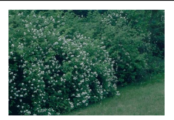
Multiflora Rose (Rosa multiflora)

Description: The coarsely toothed leaves give off a garlic-like odor when crushed. It grows quickly in the early spring, when most native species are dormant. It flowers in spring and dies off by late June leaving seedpods. It is edible.