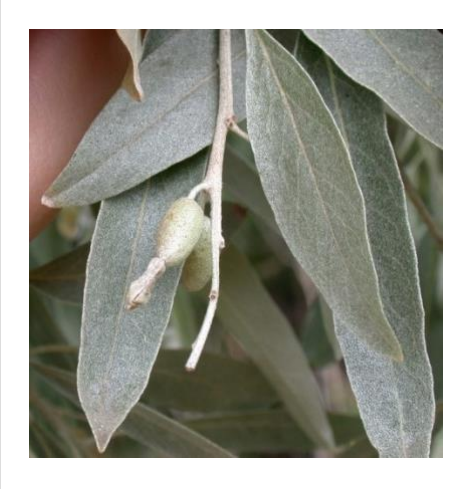
Russian olive (Eleagnus angustifolia)

Description: A thorny shrub with arching stems, climbs trees and other shrubs. Leaves divided in five to eleven sharply toothed leaflets. The base of each leaf stalk has a pair of small fringed stipules. White rose-like flowers appear in May.