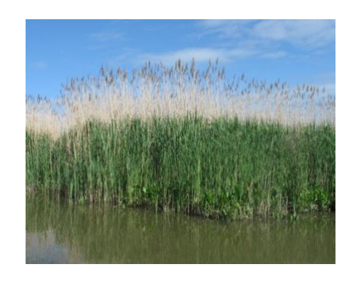
Common reed (Phragmites australis)

Description: Shrub planted along roadways and in gardens because it turns bright red in the fall. Leaves are 1-3" long, medium to dark green except in fall. Small yellow or green flowers in May or early June. Very obvious woody "wings" on stems.