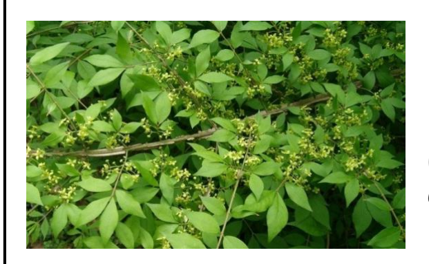
Burning Bush (Euonymus alatus)

Description: Shrub planted along roadways and in gardens because it turns bright red in the fall. Leaves are 1-3" long, medium to dark green except in fall. Small yellow or green flowers in May or early June. Very obvious woody "wings" on stems.