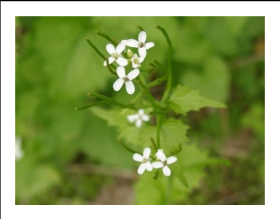
Garlic Mustard (Alliaria petiolata)

Description: The coarsely toothed leaves give off a garlic-like odor when crushed. It grows quickly in the early spring, when most native species are dormant. It flowers in spring and dies off by late June leaving seedpods. It is edible.