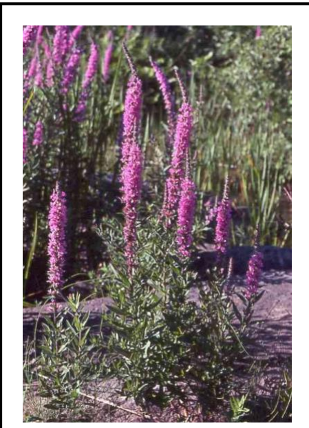
Purple Loosestrife (Lythrum salicaria)

Description: A small, thorny shrub or small tree . Leaves are egg or lance-shaped with smooth margins, alternating along the stem. The outside of the flower is covered with silvery scales.