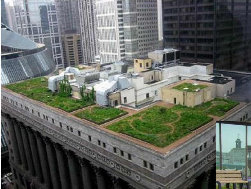
Chicago City Hall

http://static.howstuffworks.com/gif/green-rooftop-1.jpg