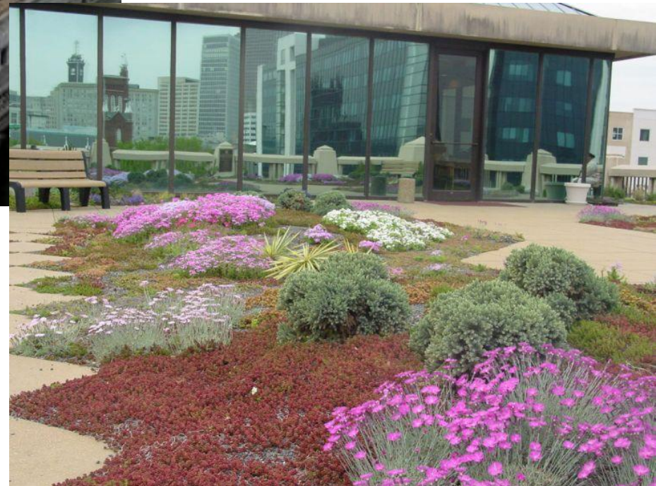
Atlanta City Hall

http://static.howstuffworks.com/gif/green-rooftop-1.jpg