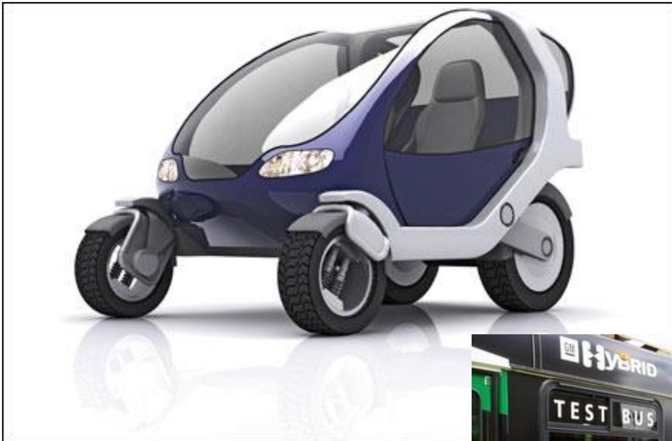
MIT's City Car